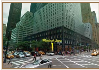
NW 41st & Third Ave