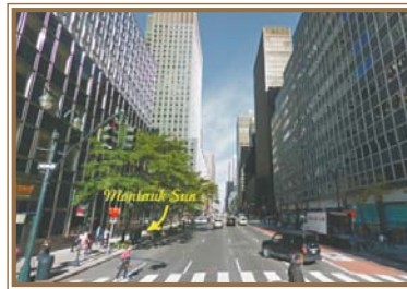
Mid S 42 between 2nd & 3rd