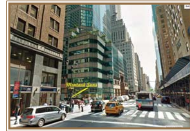
SE 44th & Lexington Ave