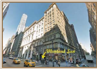
NW 5th Ave & East 36th St.

FABIANES CAFÉ & PASTRY @142 N 5TH ST VINNIE'S PIZZERIA @148 BEDFORD AVE EL BELT CAFÉ @ 158 BEDFORD AVE BEDFORD GOURMET FOOD @ 160 BEDFORD AVE ANNA MARIA PIZZA PASTA @ 179 BEDFORD AVE BAGELSMITH @ 189 BEDFORD AVE MIZU JAPANESE CUISINE @ 192 BEDFORD AVE NEW YORK MUFFINS @ 198 BEDFORD AVE NORTHSIDE GOUOMET DELI @ 200 BEDFORD AV WILLIAMSBURG CREAMERY @ 201 BEDFORD AV