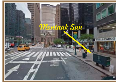
Park Ave & East 40th st