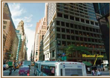
NE 39th & Madison Ave