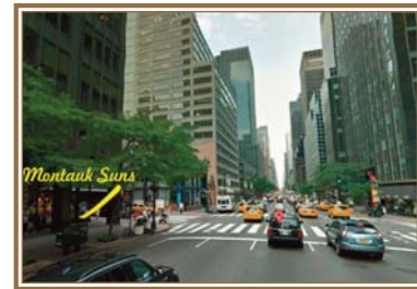
NW 40th & Third Ave