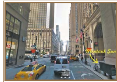
East 46th & Park Ave