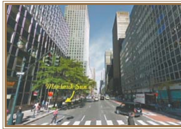
Mid S 42 between 2nd & 3rd