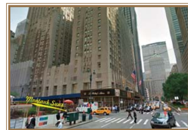
SW 50th & Park Ave