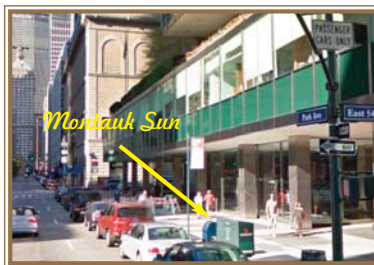
Park Ave & East 54th st.